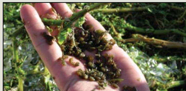
CFI's Freshwater Shrimp nursery

www.cfiglobal.com Fort Collins - Colorado 80525 Ph: 970.207.9110 Fax: 970.207.9118 181 West Boardwalk, Suite 10