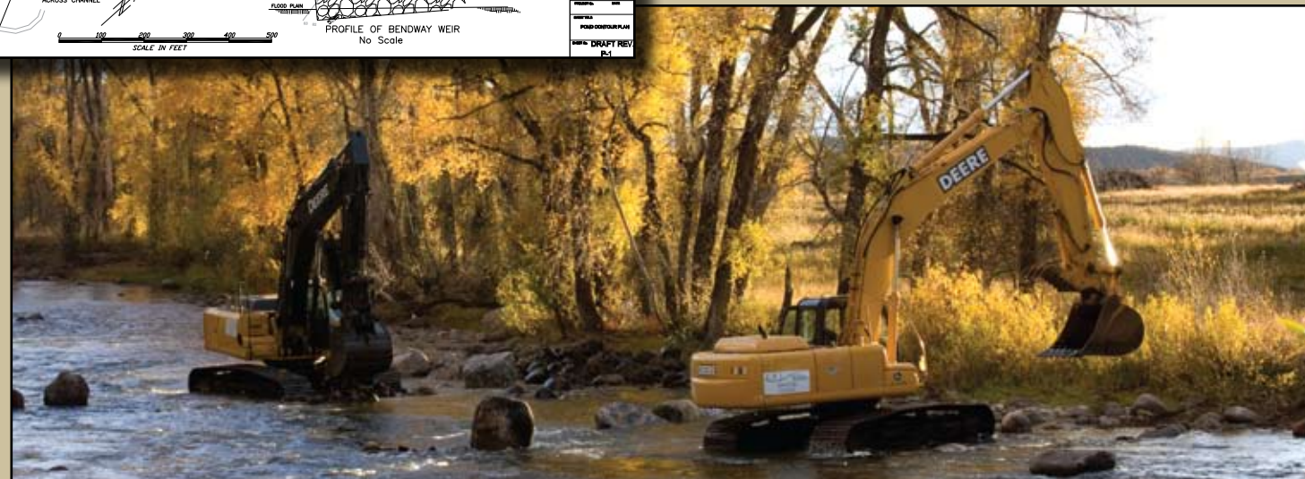
CFI at work on the Ohio Creek fishery enhancement

phase in 2012. The design and permitting for a natural-feeling spring creek fishery has been completed, along with associated ponds and waterfowl habitat, and is set for construction in the spring of this year.