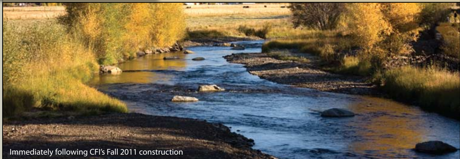
Immediately following CFI's Fall 2011 construction