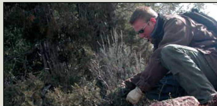
Detailed stream corridor analysis