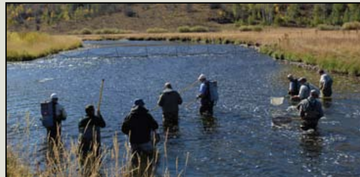
CFI conducting a fish population survey