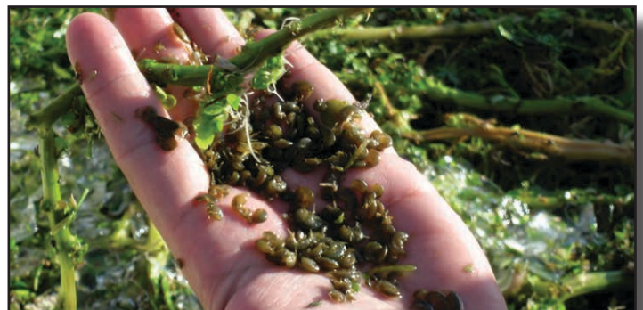
SFG's Freshwater Shrimp nursery