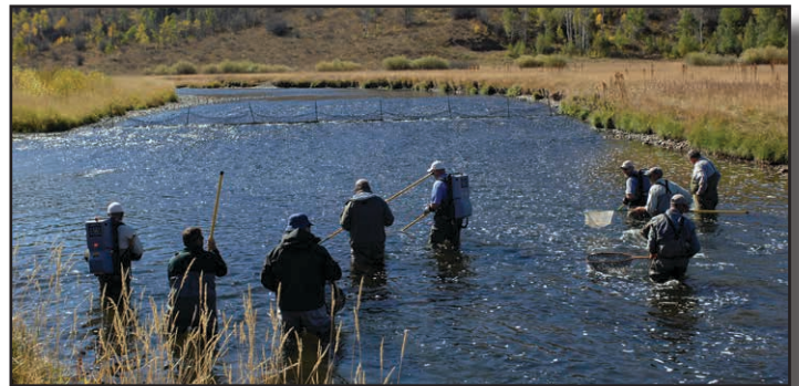
SFG conducting a fish population survey