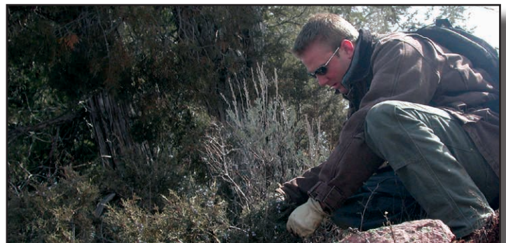
Detailed stream corridor analysis